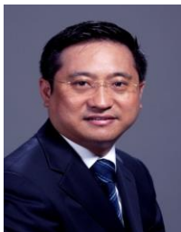
New Council Members (Terms: July 2018 - July 2020)